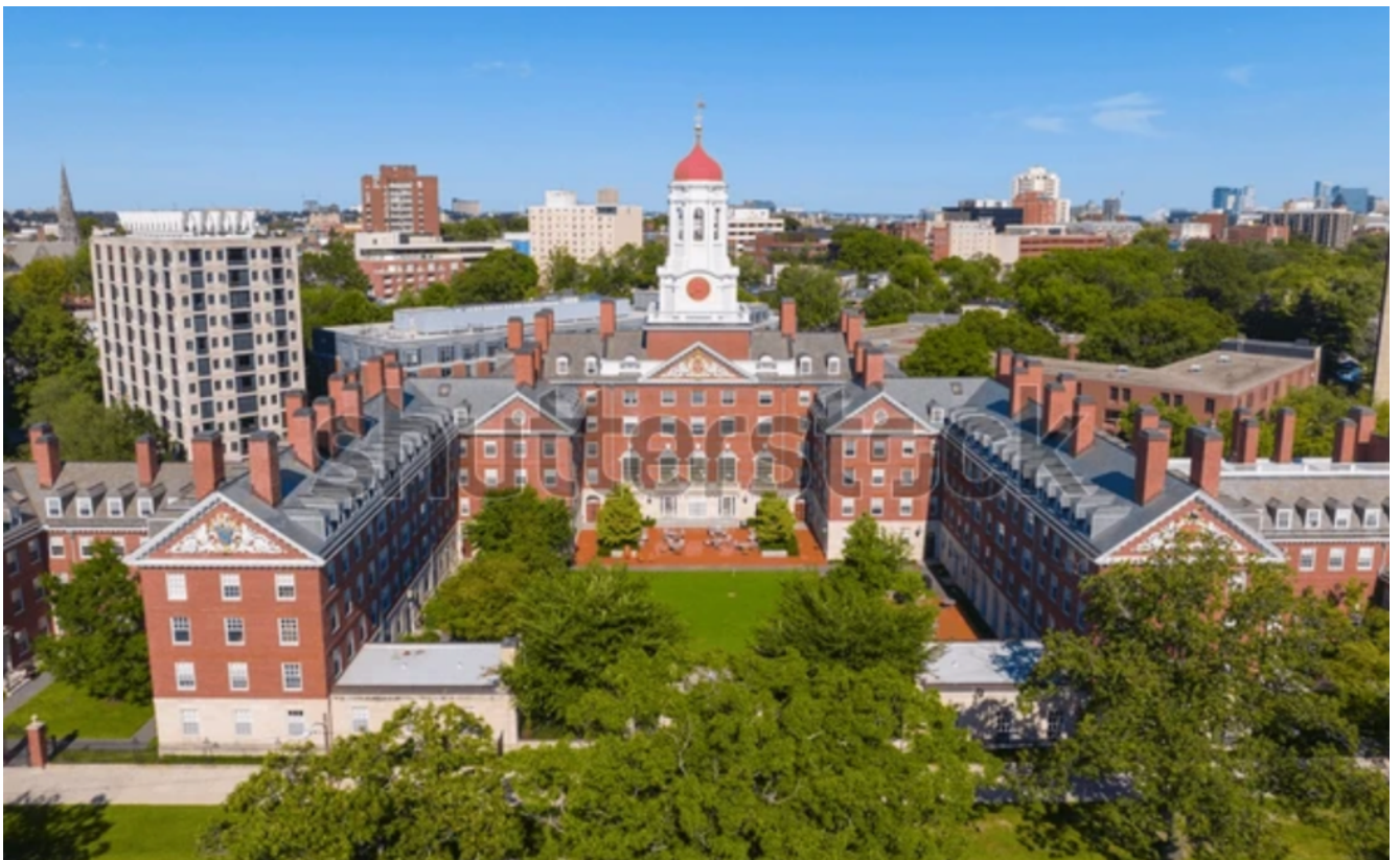
Photo of the campus at Harvard University, currently defending its academic freedom